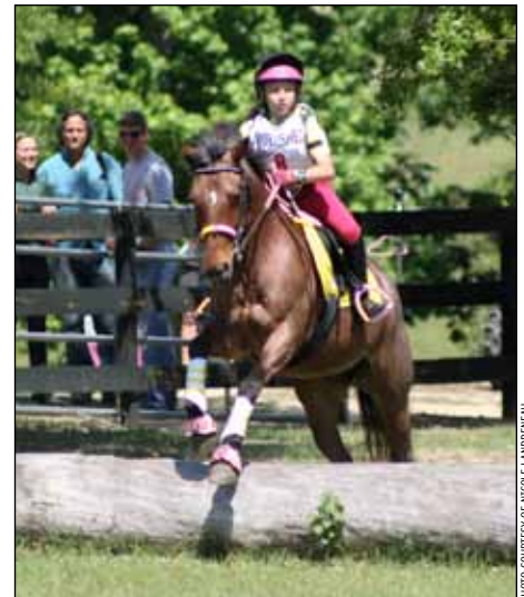
Riding cross country at Fleur de Leap.