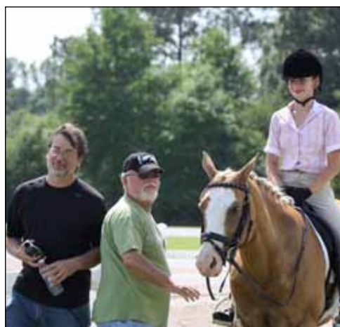
It takes a team to do this right...