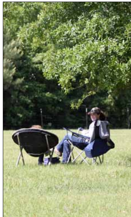
Cross country volunteers at Lagniappe.