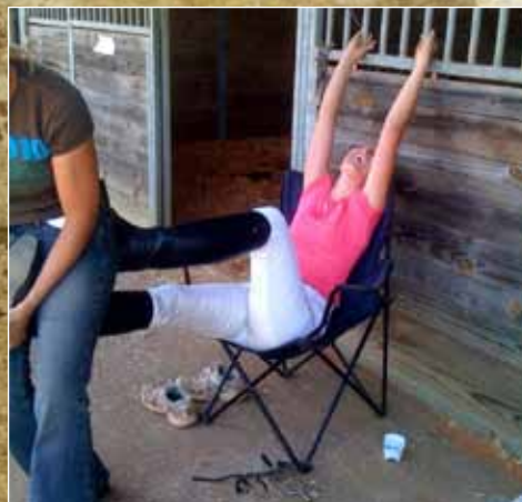
It's all fun and games until the boots have to come off!