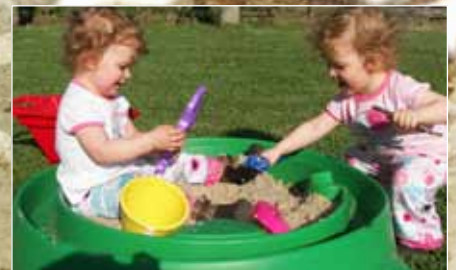
The Schiefelbein twins digging for their first pony.